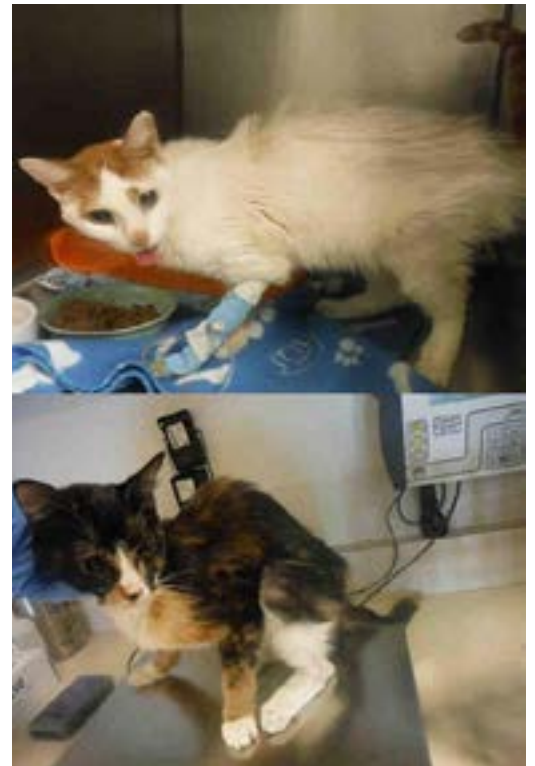
Mango and Tango were just days from death when an OHS veterinarian first laid eyes on them.

Investigation Services agents are struggling to end cruelty to animals so Mango, Tango and other animals like them don't have to suffer. The need for support is greater than ever, as the number of investigations has grown by 26 per cent in just two years. The province has recognized this growing need and is now funding part of the work of RIS investigators. Unfortunately, the funding only covers a small portion of the ever-increasing need. While every dollar of that funding will go toward saving animal lives, we still need your help.