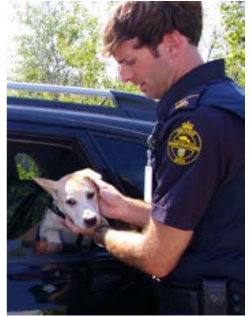
More people are turning to the OHS for help when they see a dog locked in a hot car.

Thanks to you, OHS agents will be there to save the next dog from a hot car. Visit the OHS website to read about the most recent OHS rescues of dogs in hot cars. 🐾