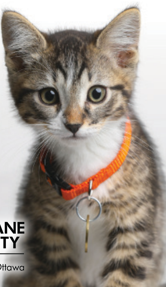
Bumble Adopted Sept. 2024

The OHS has achieved accreditation with Humane Canada, demonstrating leadership in all aspects of sheltering, animal care, outreach, education and advocacy.